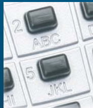
Large Punch Buttons