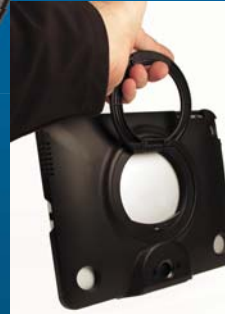
Carry like a briefcase